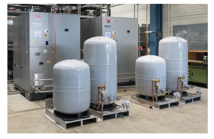
A contained ethane/propane cascade cooling system

To overcome these shortfalls, GEA has now developed an innovative air cycle system for freeze dryers that also incorporates CO_2 cooling. GEA CO_2 booster systems can reach temperatures down to -50 °C and are suitable for a wide range of product freezing applications. The cooling system uses natural refrigerants and has a GWP of 1 (equivalent to CO_2 ). The corresponding air cycle cooler, for optimal energy utilization, is used to chill the condenser and as a booster during the freezing process. Although having a slightly higher energy consumption requirement compared with high GWP refrigerants, no silicone oil storage is needed.